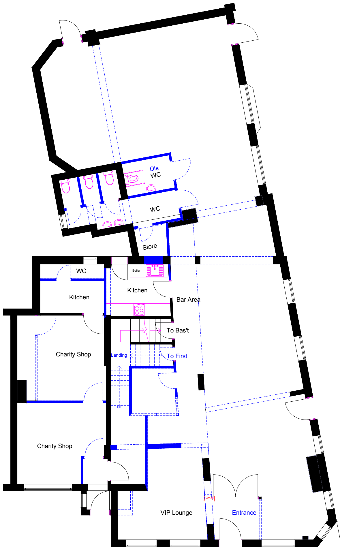
PROPOSED GROUND FLOOR DEMOLITION TO BE DEMOLISHED

The contractor is responsible for checking dimensions, tolerances and references. Any discrepancy to be verified with the Architect before proceeding with the works. Where an item is covered by drawings to different scales the larger scale drawing is to be worked to. Do not scale drawing. Figured dimensions to be worked to in all cases.