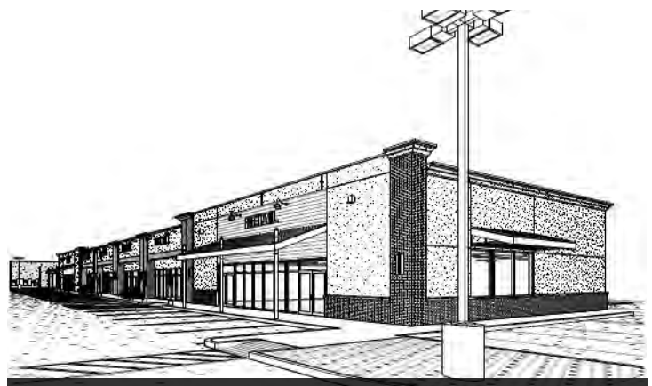
Conceptual Plans - Side View

LYNANN PINKHAM 361.288.3102 lynann@craveyrealstate.com