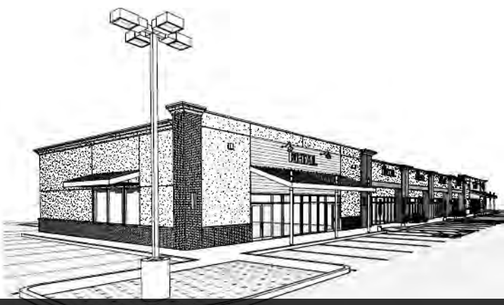
Conceptual Plans - Side View