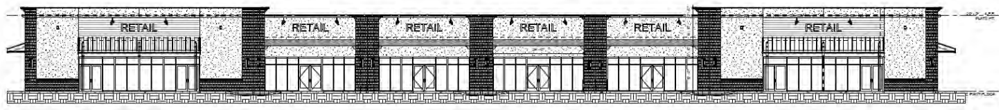
Conceptual Plans - Building Elevations