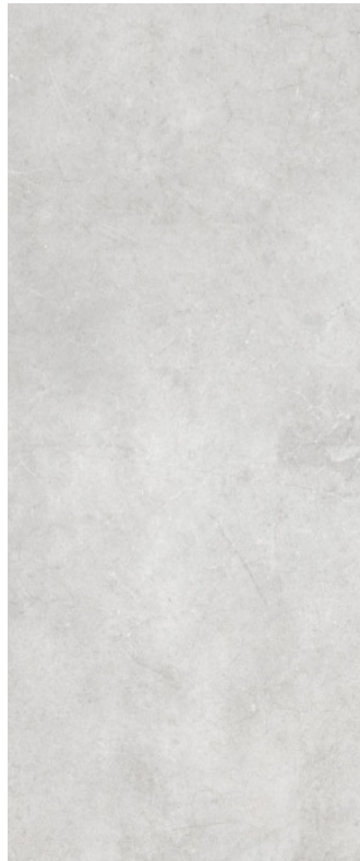
Polished Concrete Flooring