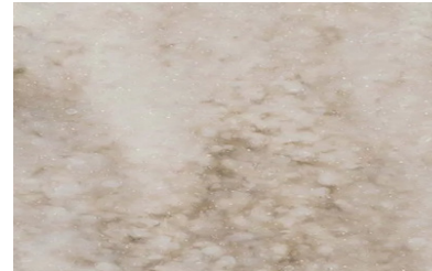
Solid Countertop- Wilsonart Iron Falls- 9238SS