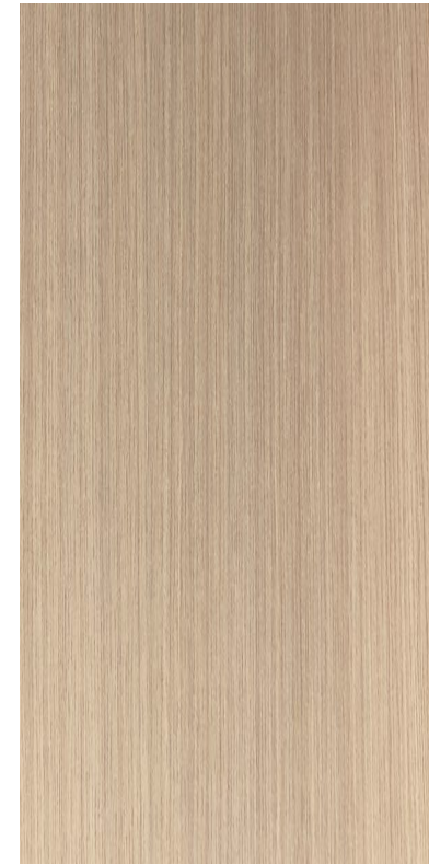
Laminate Millwork- Nevamar Aurora Oak- W002600-Natural Wood