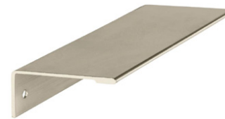
Edge Pull- Amerock 4-1/2" Long Finger Cabinet Pull- Satin Nickel