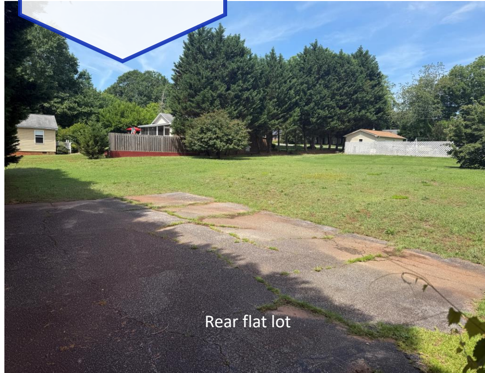
Rear flat lot