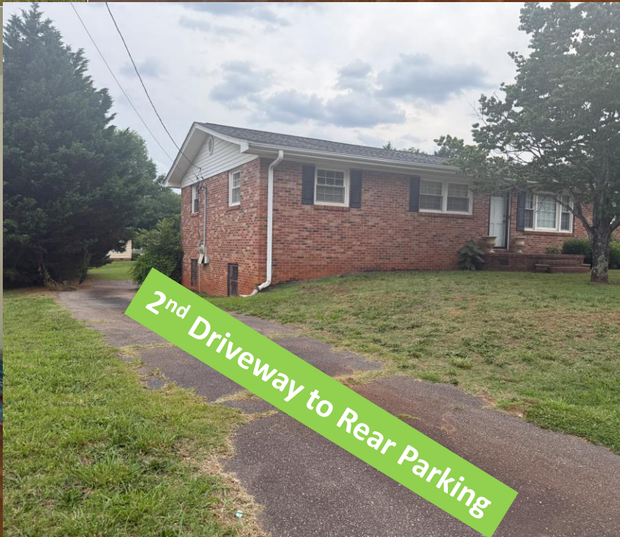
2nd Driveway to Rear Parking