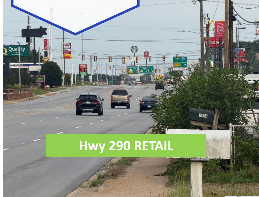
Hwy 290 RETAIL