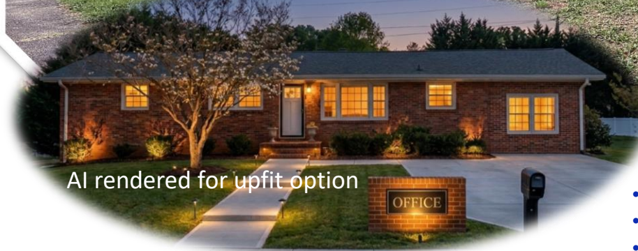
AI rendered for upfit option