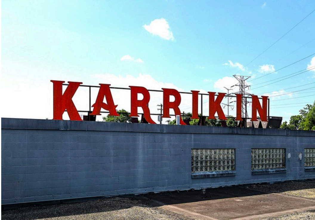
3717 JONLEN DRIVE | FOR LEASE