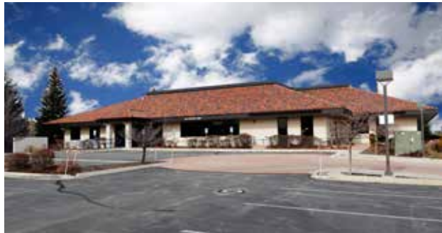
5411 Kietzke Lane, Reno 14,918 SF Class A Office/Medical