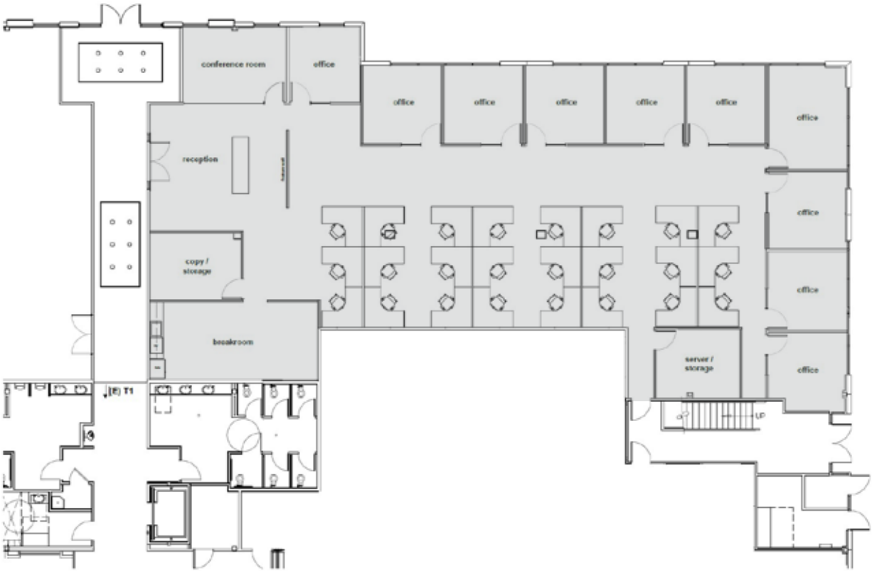
* Floor Plan May Not Be Exact