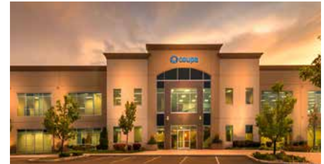
10615 Professional Circle, Reno 46,810 SF Class A Office