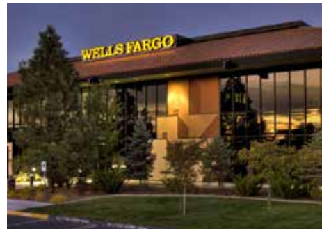
5340 Kietzke Lane, Reno 55,917 SF Class A Office