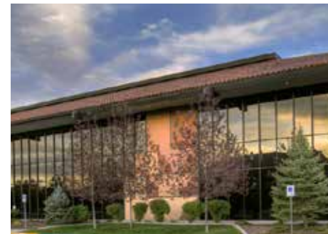
5370 Kietzke Lane, Reno 55,559 SF Class A Office