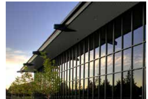
5390 Kietzke Lane, Reno 65,917 SF Class A Office