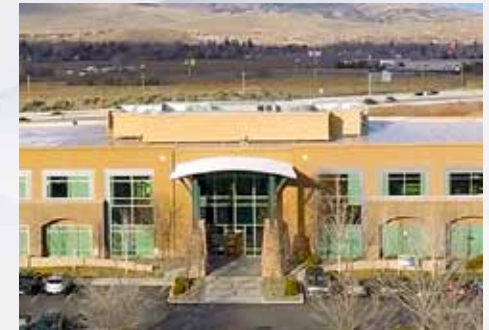
10345 Professional Circle, Reno 64,360 SF Class A Office