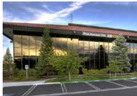
5310 Kietzke Lane, Reno 55,387 SF Class A Office