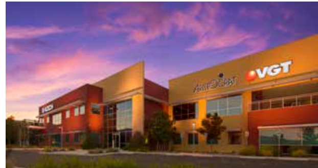
887 Trademark Drive, Reno 53,437 SF Class A Office