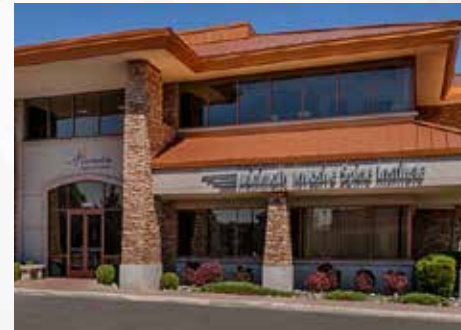
9990 Double R Blvd., Reno 20,549 SF Class A Commercial Office and Medical Building

NevDex Properties is Reno's premier landlord for Class A office space. We develop, own and manage approximately 420,000 rentable square feet in Reno, Nevada, including the NevDex Office Park. By providing creative deal structures with flexible lease terms, expansion rights and landlord sponsored improvement dollars, we offer the most professional and flexible leasing solutions that can help you thrive in today's rapidly changing work environment.