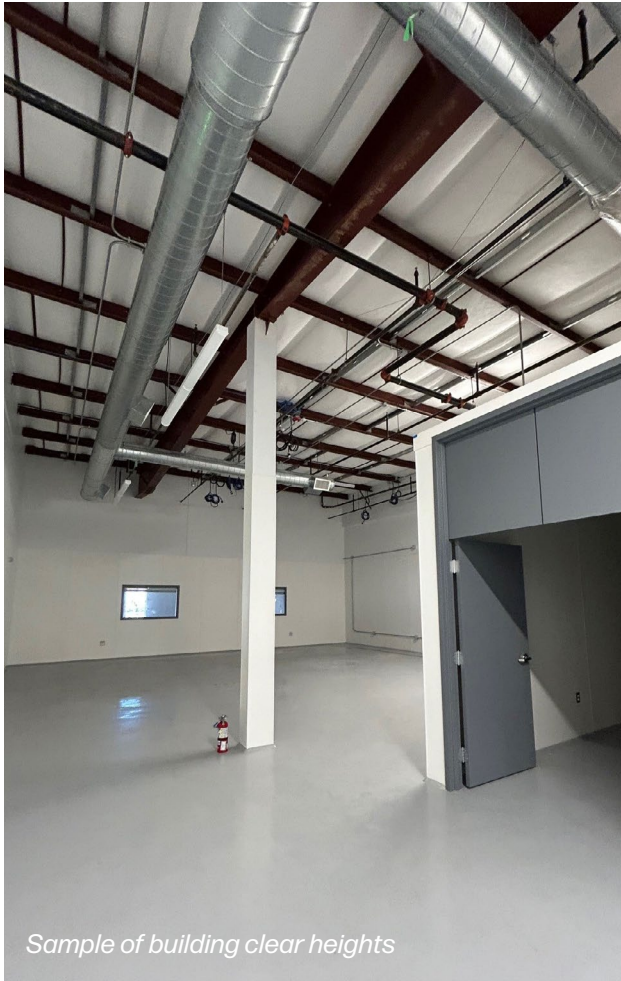
Sample of building clear heights