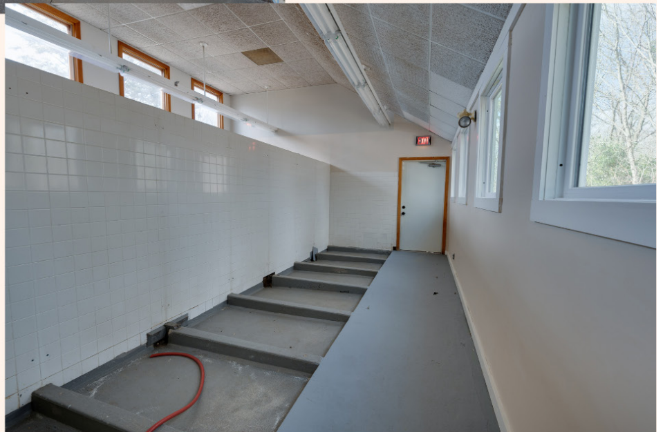
Kennels (same on each side)