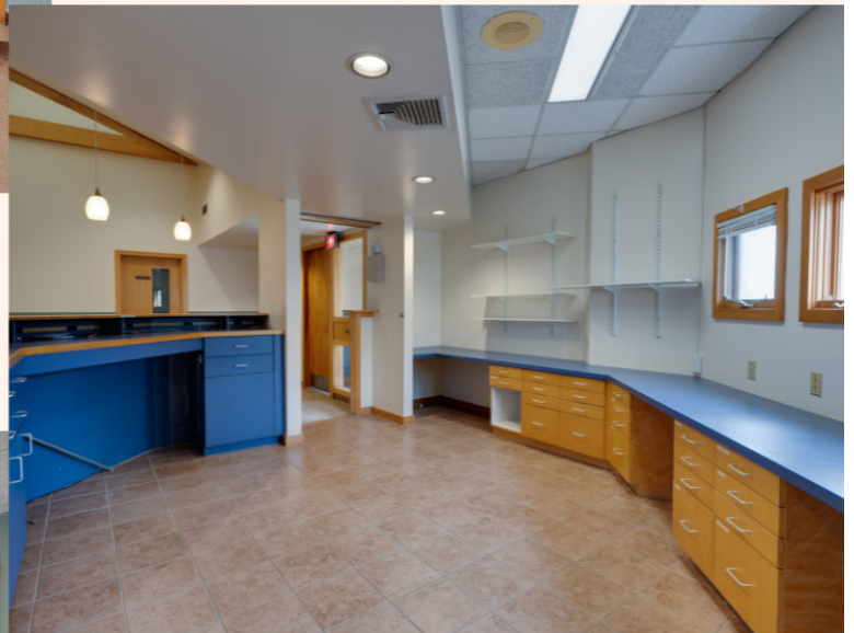
Reception Desk Area