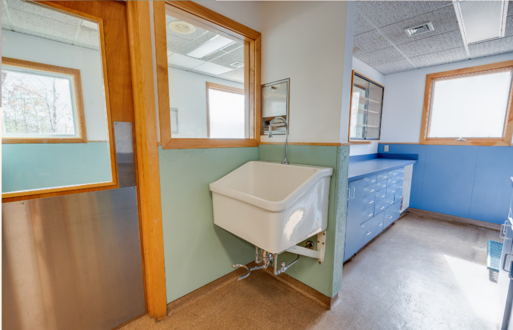
Surgery Prep Area