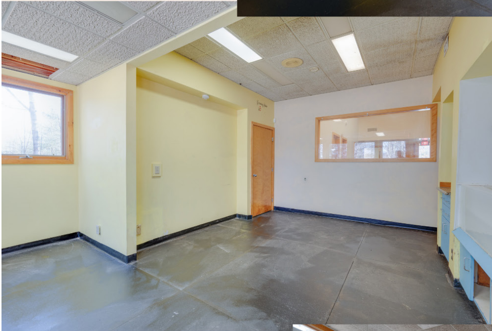
Grooming (view #2 facing Lobby windows)