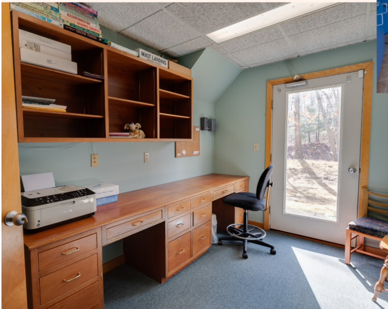
Doctor's/ Admin Office