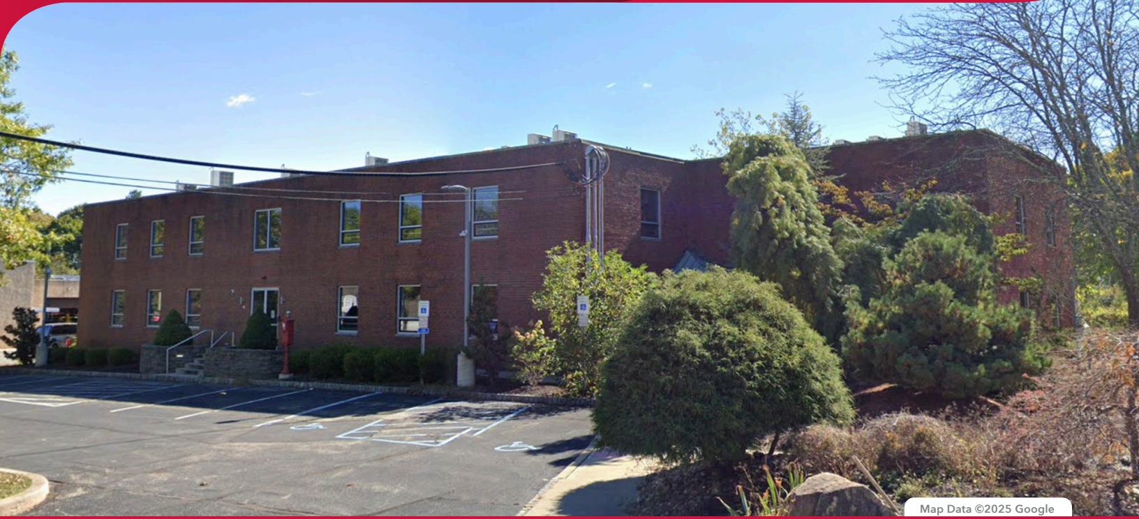
Map Data ©2025 Google

39 & 43 EMERY AVENUE FLEMINGTON, NJ 08822