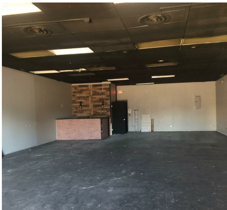
341-343 Hastings: 3,000 square feet

GAUT·WHITTENBURG·EMERSON Commercial Real Estate CCIM SIOR