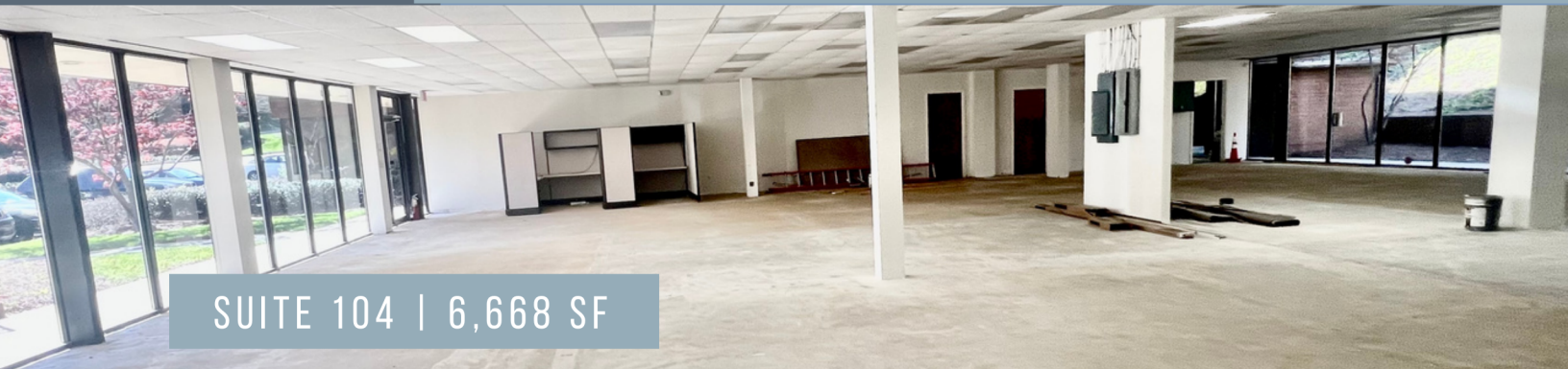
SUITE 104 | 6,668 SF

FOR LEASE | 4,309 SF & 6,668 SF - 1ST FLOOR