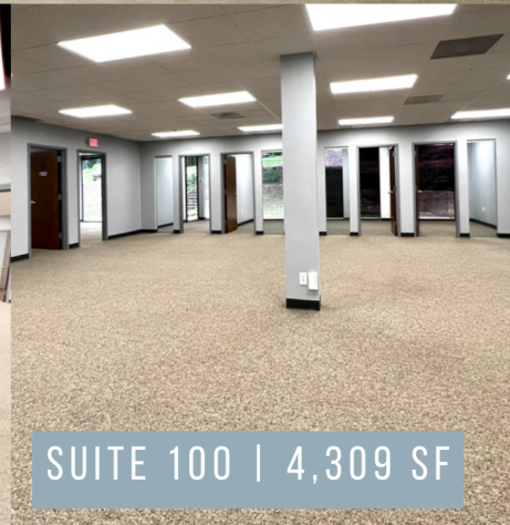
SUITE 100 | 4,309 SF