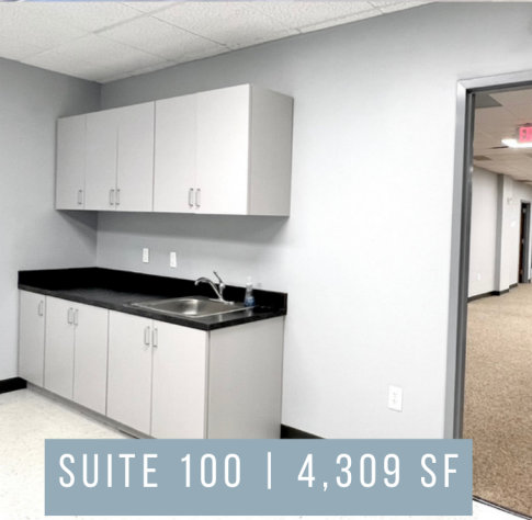
SUITE 100 | 4,309 SF