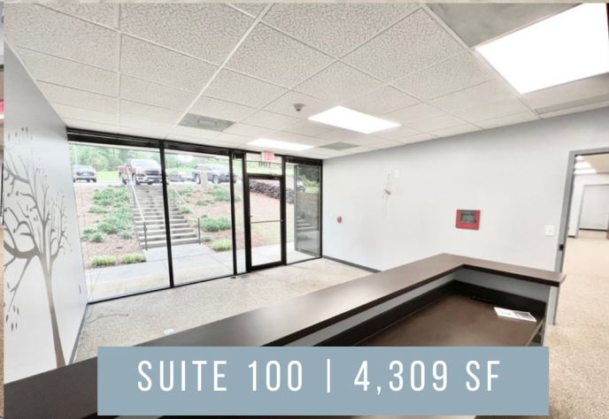
SUITE 100 | 4,309 SF