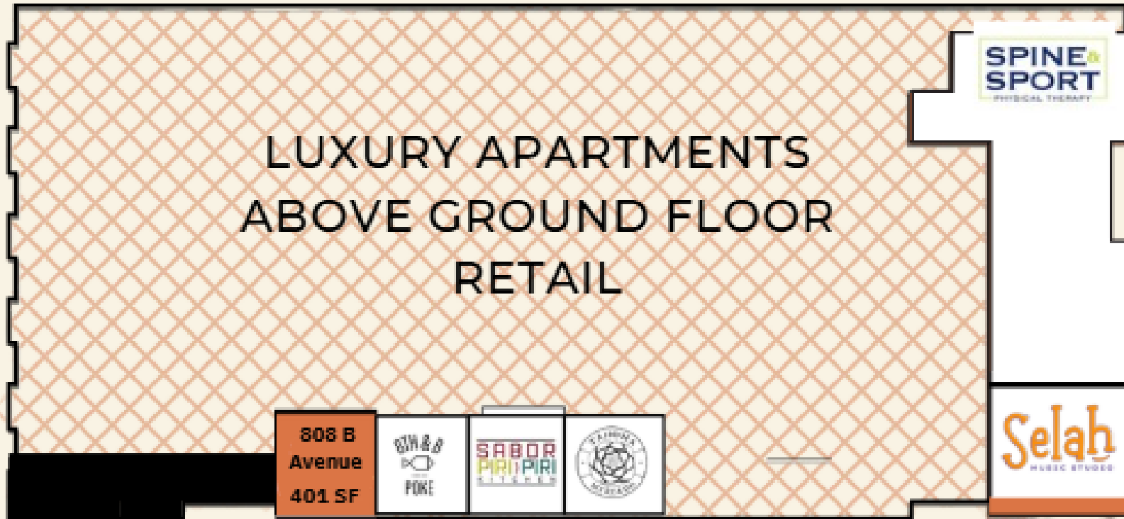
B Avenue Frontage