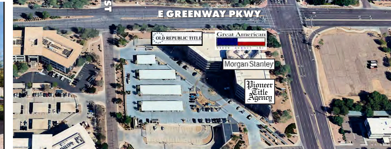
AERIAL OVERVIEW - KIERLAND COMMONS