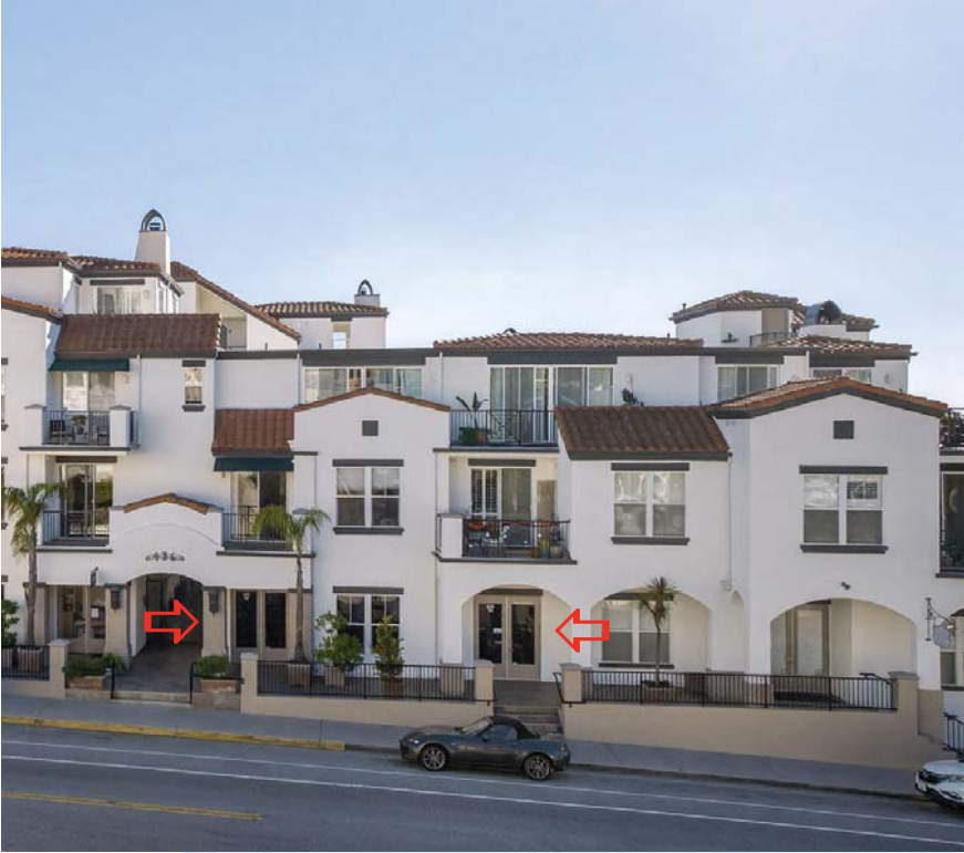
428 POLI STREET, Unit 2D