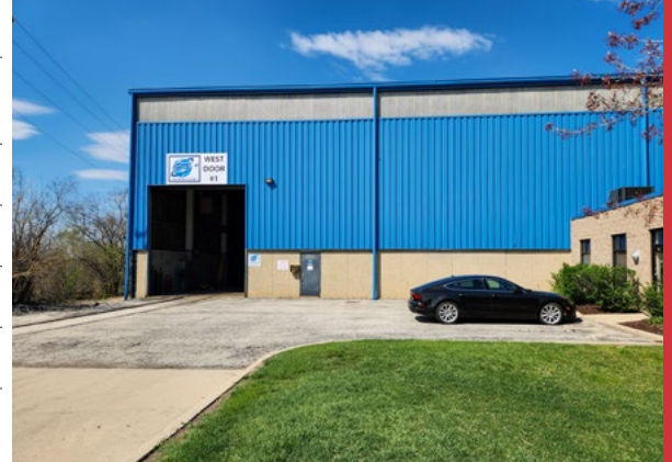
Pictured: Front Load/Unload Area Near Active Rail Spur