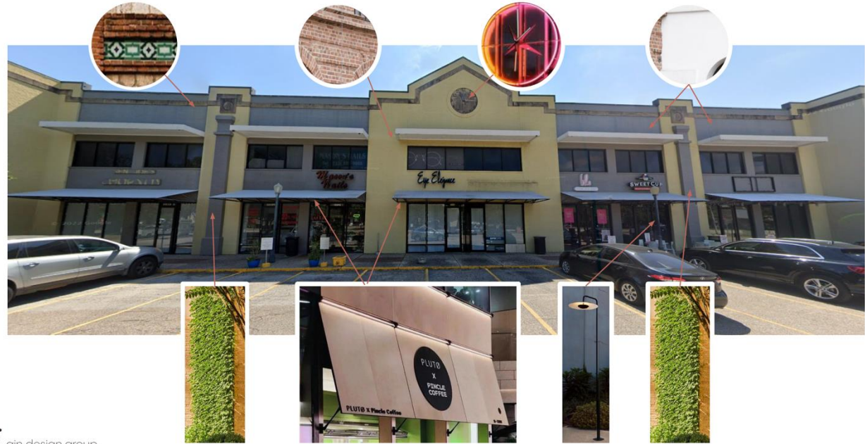
Current Exterior Mock-up