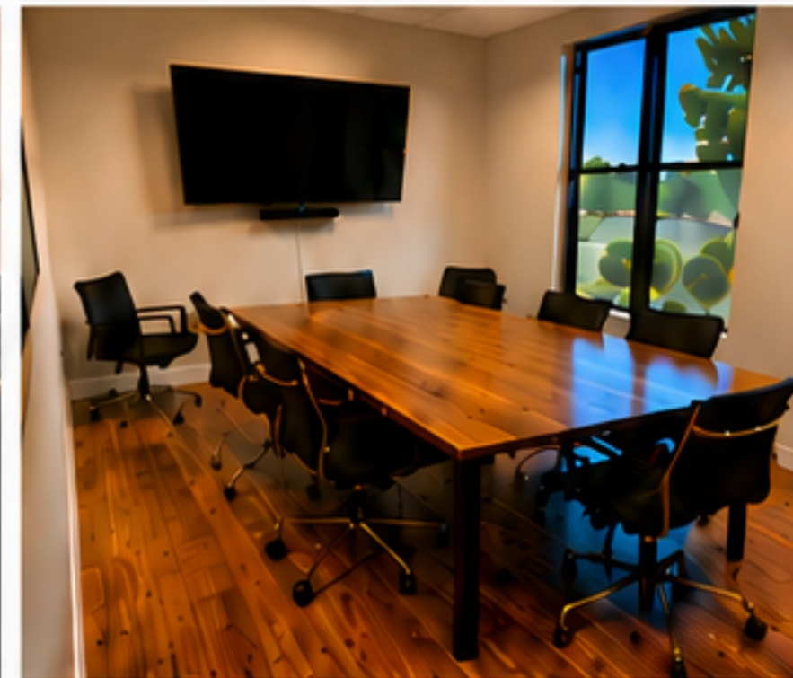
OFFICE 2 / CONFERENCE ROOM