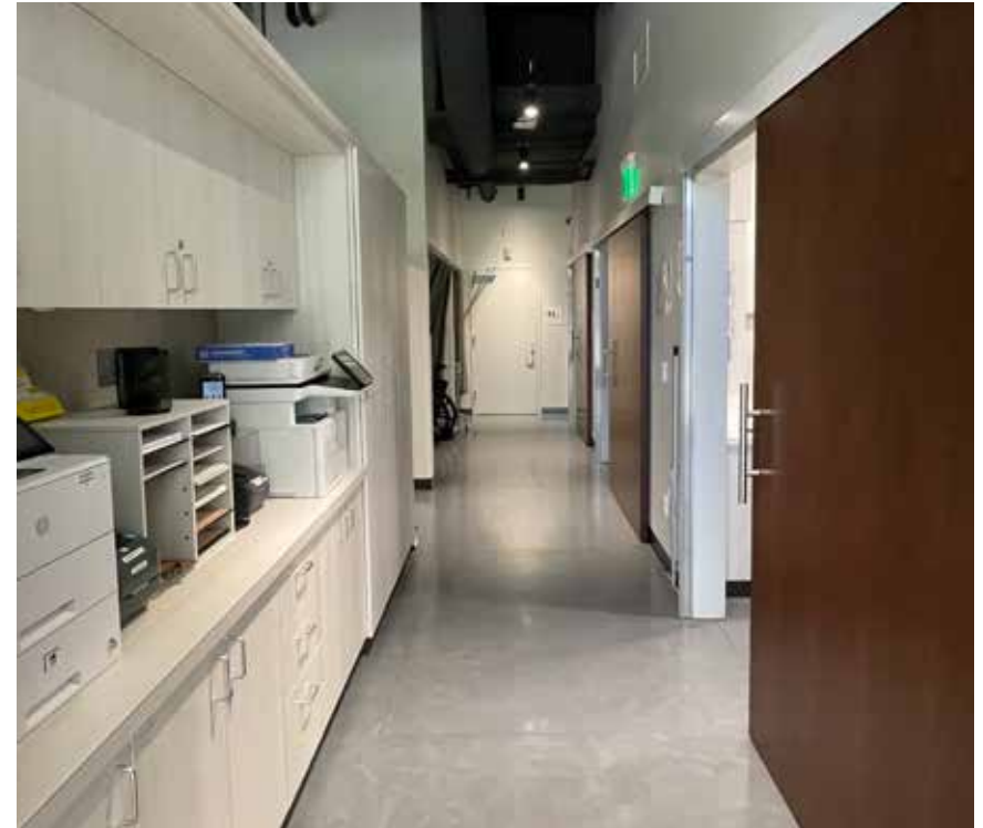
1,690 SF OF MEDICAL SPACE IN PORTLAND'S PEARL DISTRICT