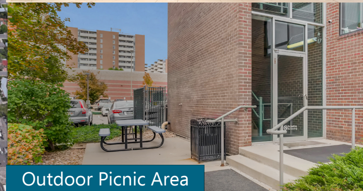
Outdoor Picnic Area