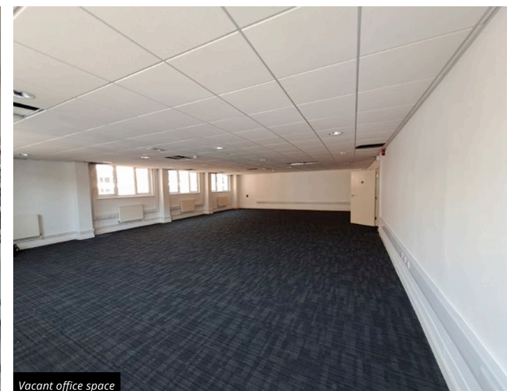
Vacant office space