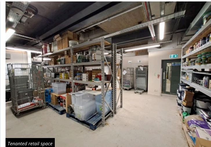
Tenanted retail space