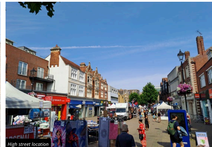
High street location