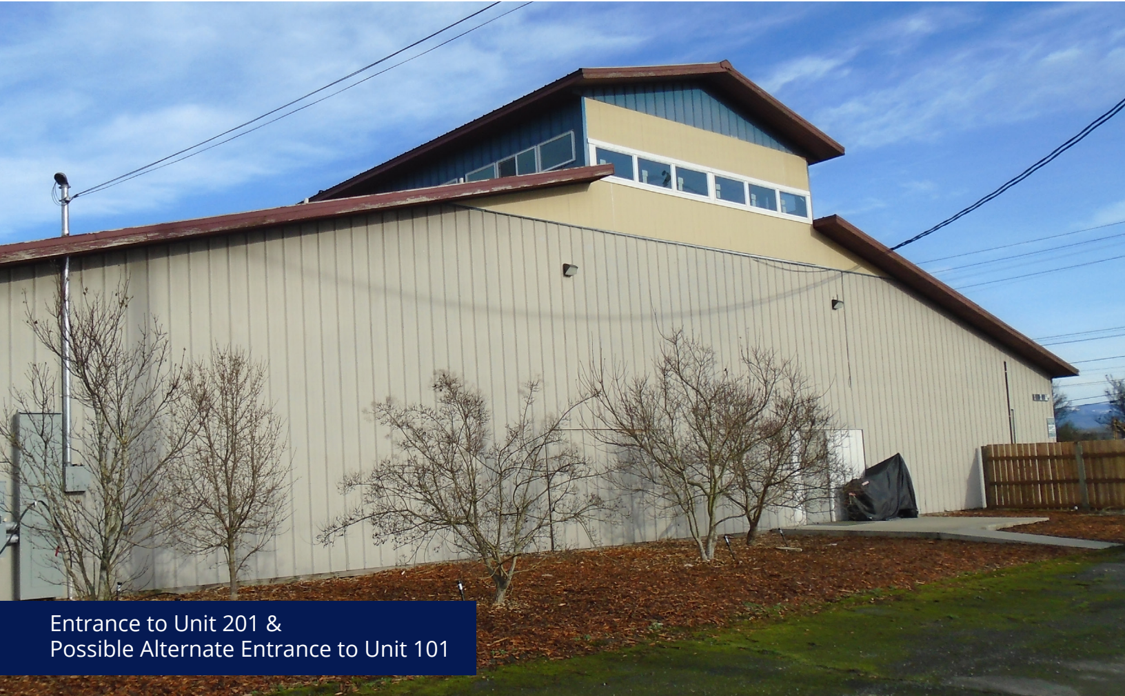
Entrance to Unit 201 & Possible Alternate Entrance to Unit 101