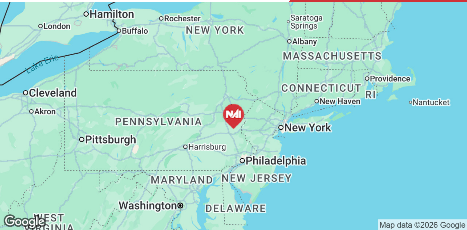
Map data ©2026 Google