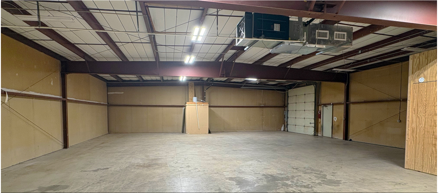
Interior of Warehouse