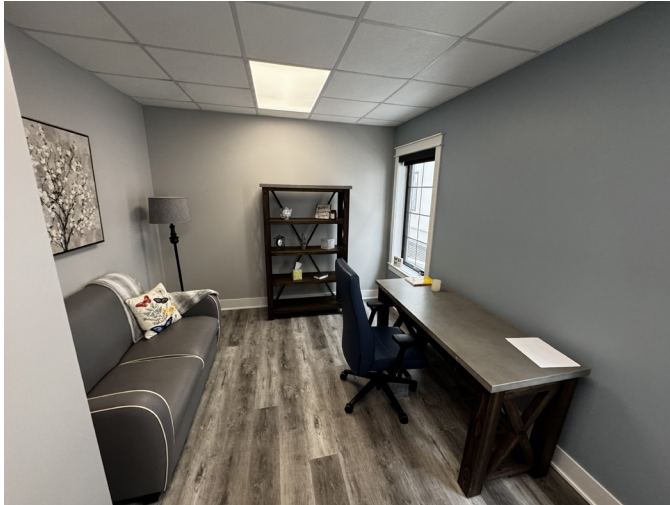
Suite 102 | 171 SF | $1,100/mo