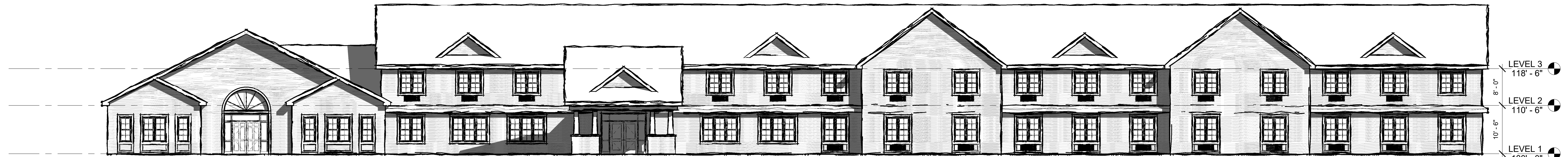
① EAST ELEVATION 3/32" = 1'-0"

LEVEL 3 118'-6" LEVEL 2 110'-6" LEVEL 1 100'-0"