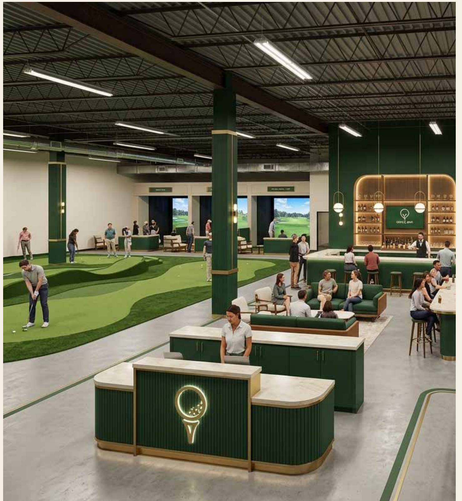
The property's scale, parking and operational flexibility create opportunities for entertainment, sports simulation and membership-driven business models.