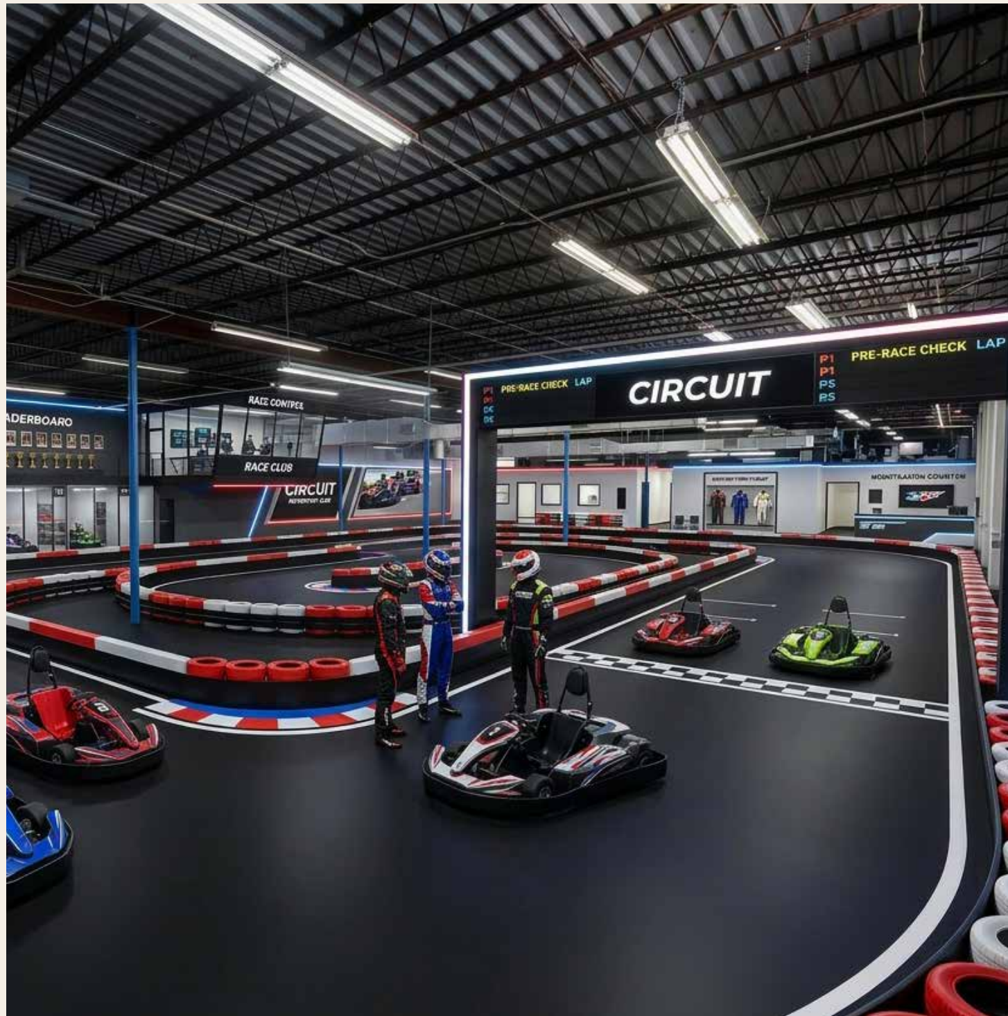
The open-span environment supports indoor recreation, entertainment and experiential concepts designed to create repeat customer traffic and destination-driven activity.