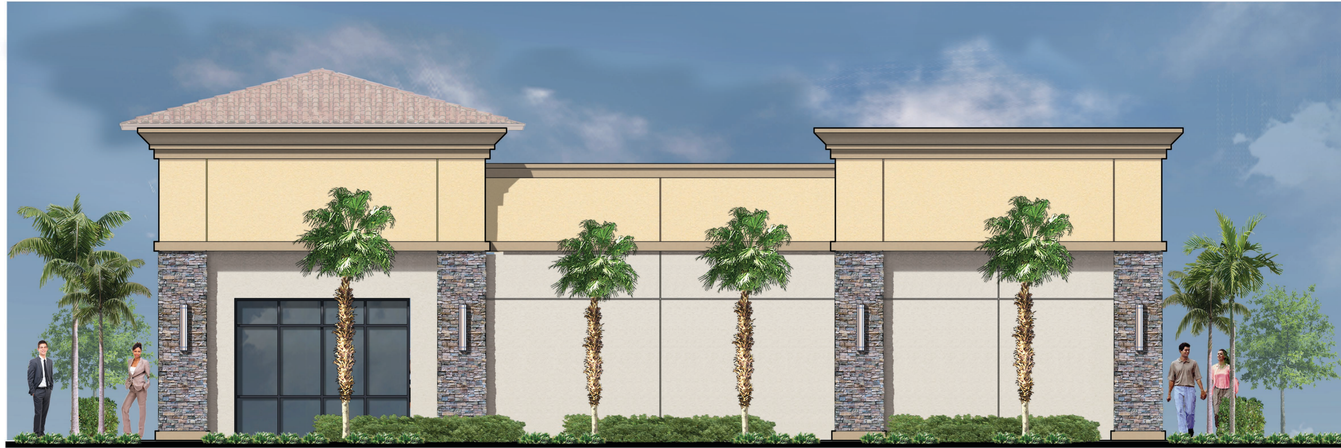
NORTH ELEVATION 1/4" = 1'-0"