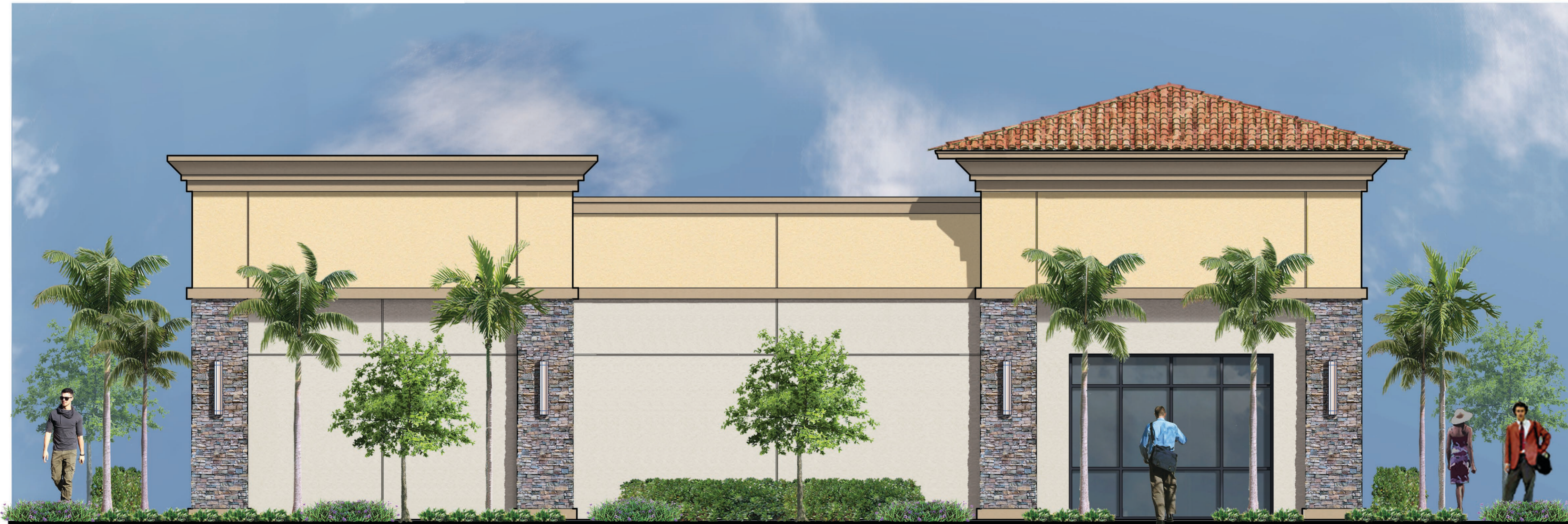
SOUTH ELEVATION 1/4" = 1'-0"