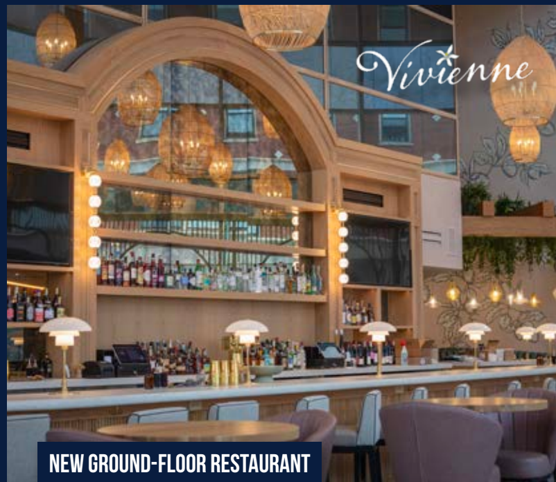
NEW GROUND-FLOOR RESTAURANT