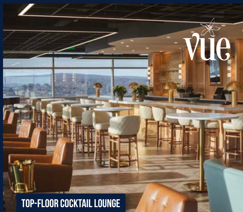
TOP-FLOOR COCKTAIL LOUNGE