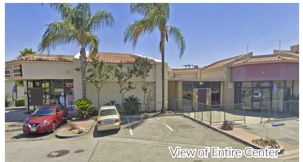
View of Entire Center