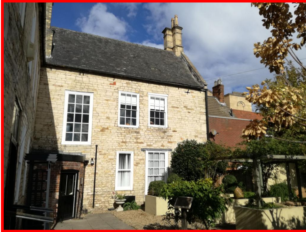
Main entrance into Elmer House