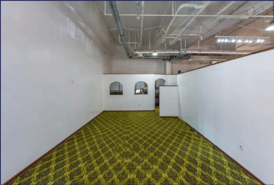
750 SF OPEN-SPACE WITH PRIVATE ENTRANCE