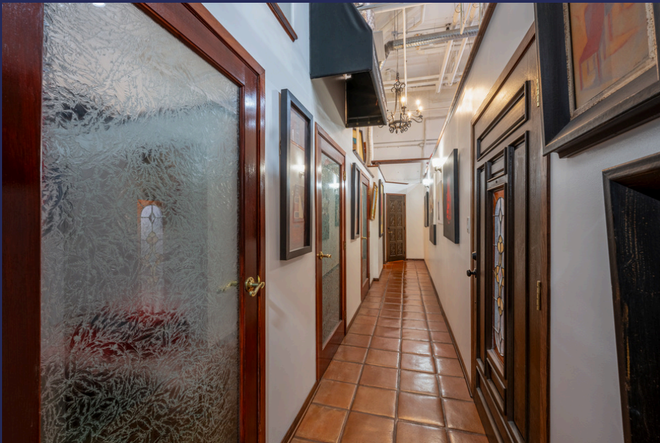
4 OFFICE / STORAGE ROOMS + RESTROOM