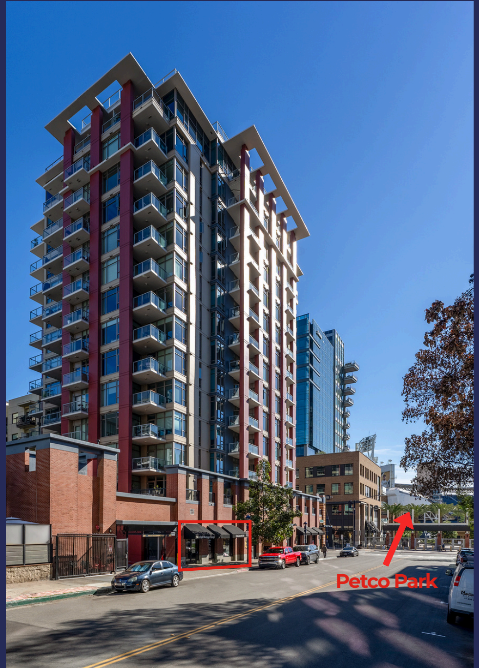
GROUND-FLOOR OF 113 RESIDENTIAL UNITS & CO-TENANT WITH 7/11 + RESTAURANTS