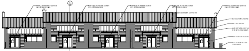
2 NORTH ELEVATION SCALE: 1/8" = 1'-0"