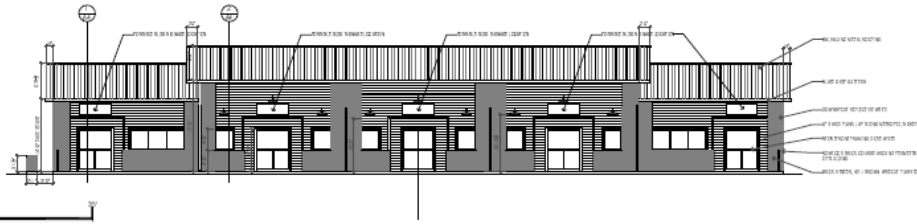
1 SOUTH ELEVATION SCALE: 1/8" = 1'-0"