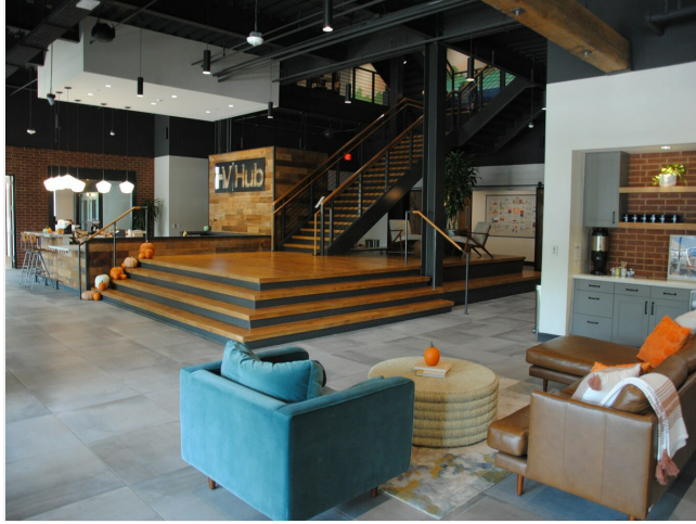
Welcome Desk 2