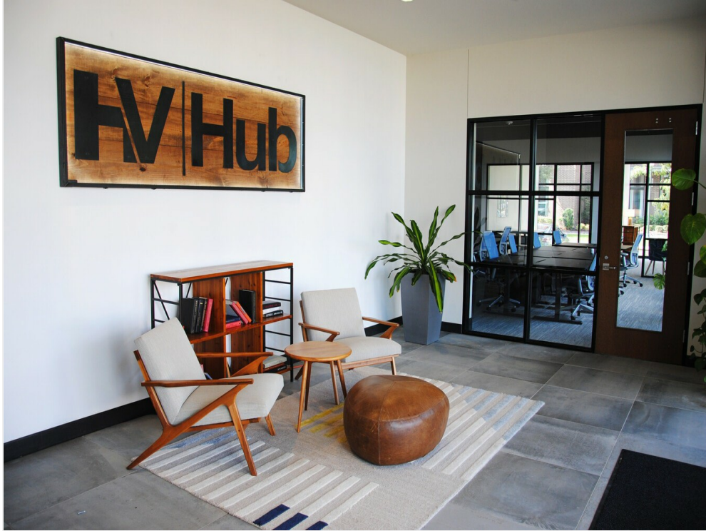
Hub Sitting Area