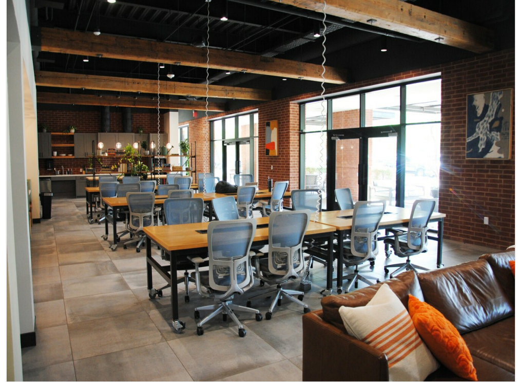
Common Area 2