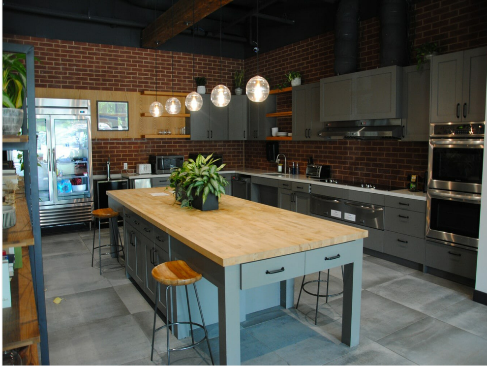
Kitchen Ground Floor 2