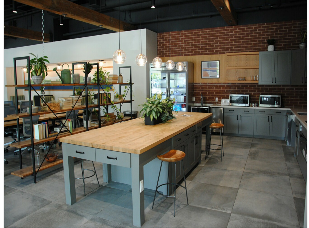
Kitchen Ground Floor