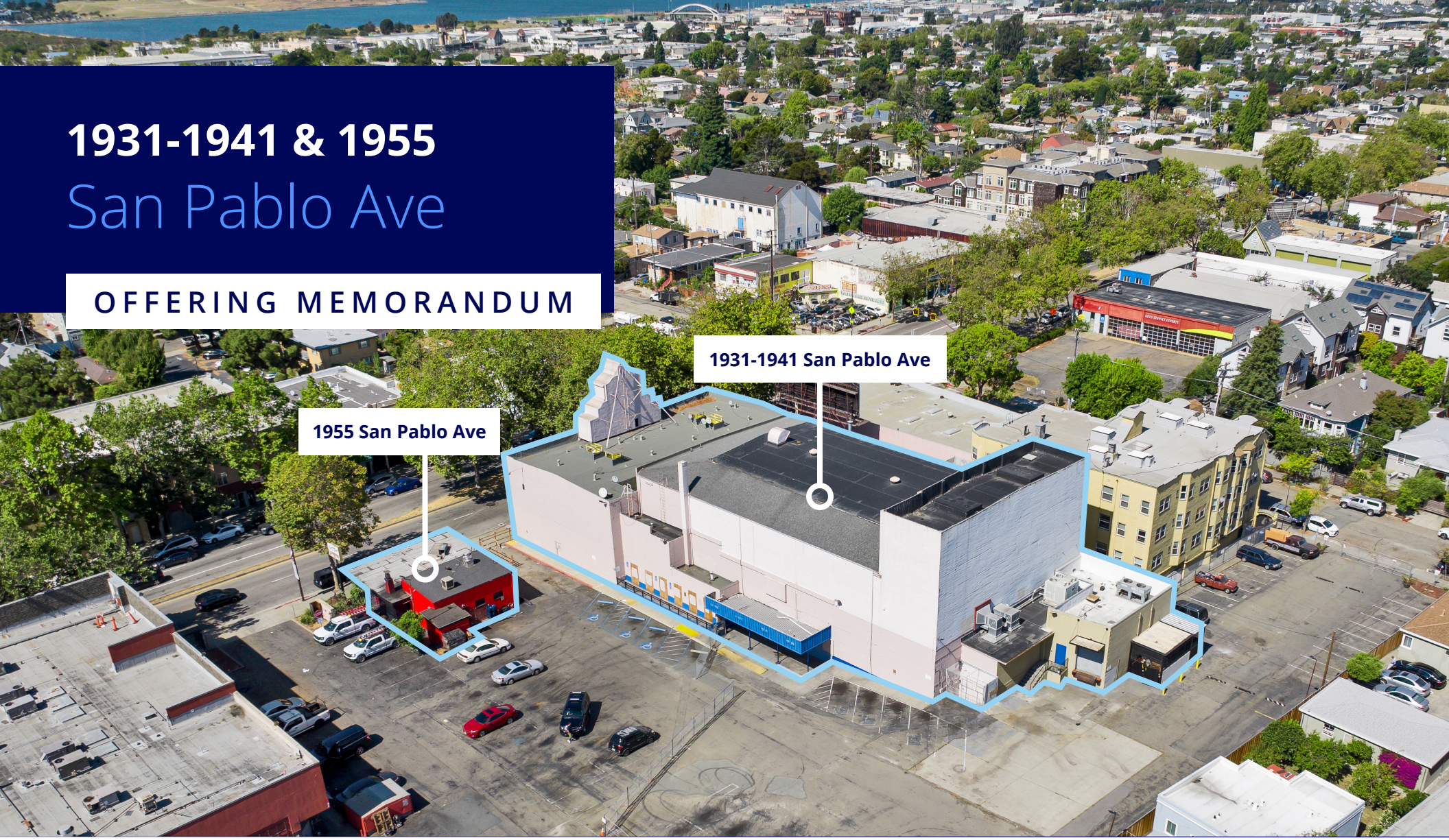
1931-1941 San Pablo Ave