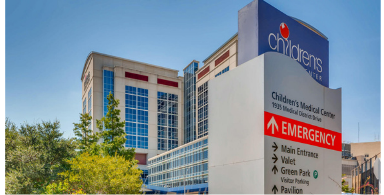
Dallas Medical District