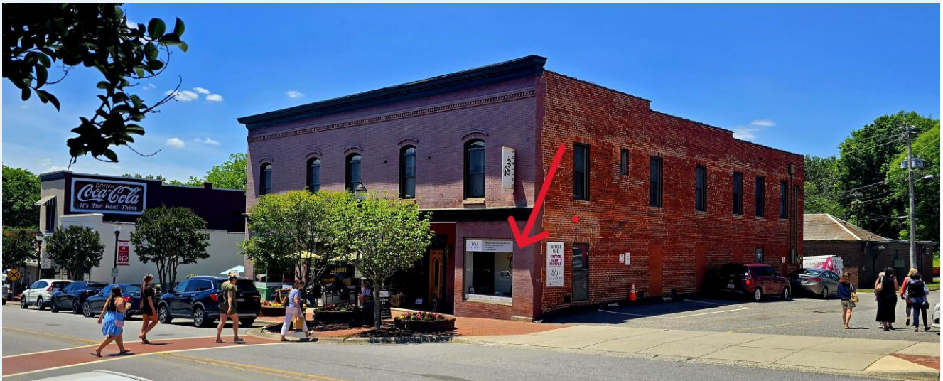
25B North Main Street | Historic Downtown Belmont, NC