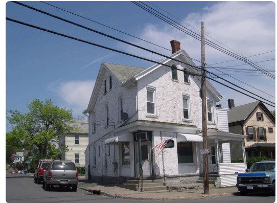
05/17/2007 - Photo

SWIS 510800 Status Active Roll Section Taxable Property Class 483 - Converted Res Ownership Code In Ag District No Zoning T4MS - T4 Main Street Neighborhood 8005 Midtown School District KINGSTON CONSOLIDA Property Description Total Acreage/Size 61 x 100 Deed Book 02442 Deed Page 00213 Grid East 632881 Grid North 1127307