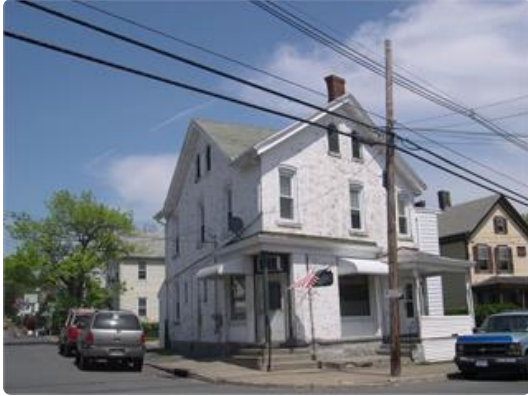
05/17/2007 - Photo