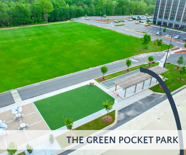
THE GREEN POCKET PARK