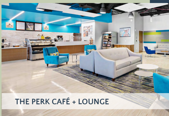
THE PERK CAFÉ + LOUNGE