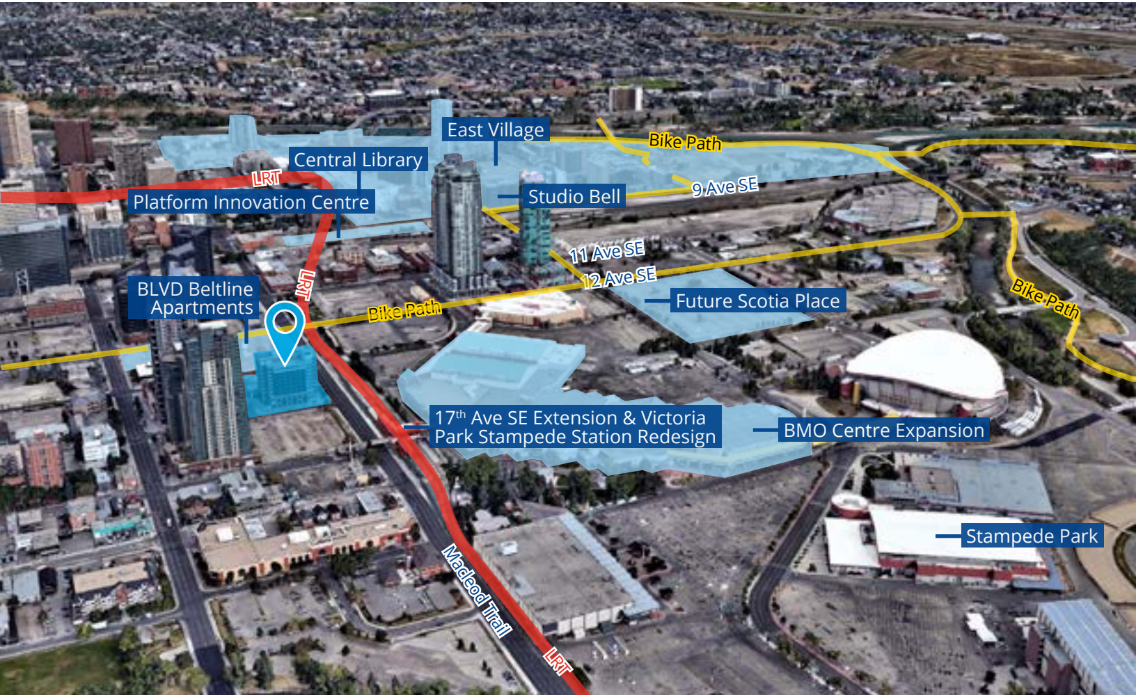
Rendering | Scotia Place