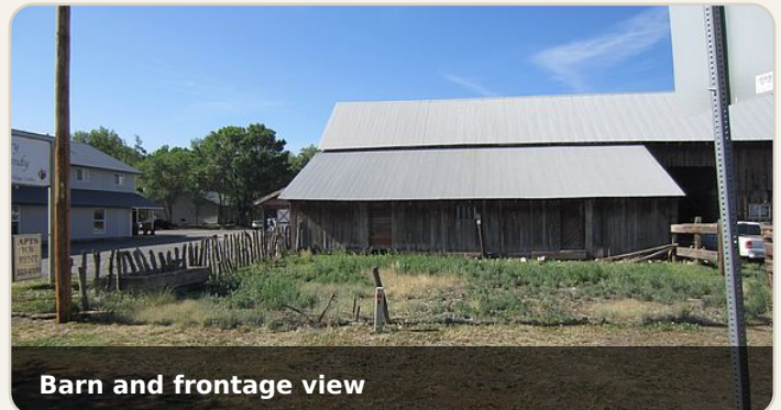
Barn and frontage view