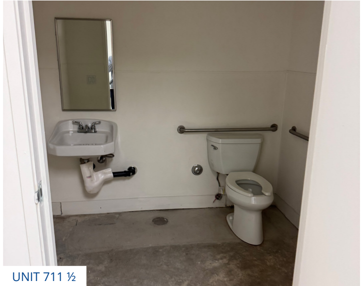
UNIT 711 ½