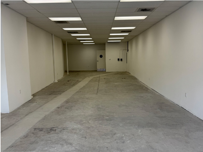
UNIT 711 ½