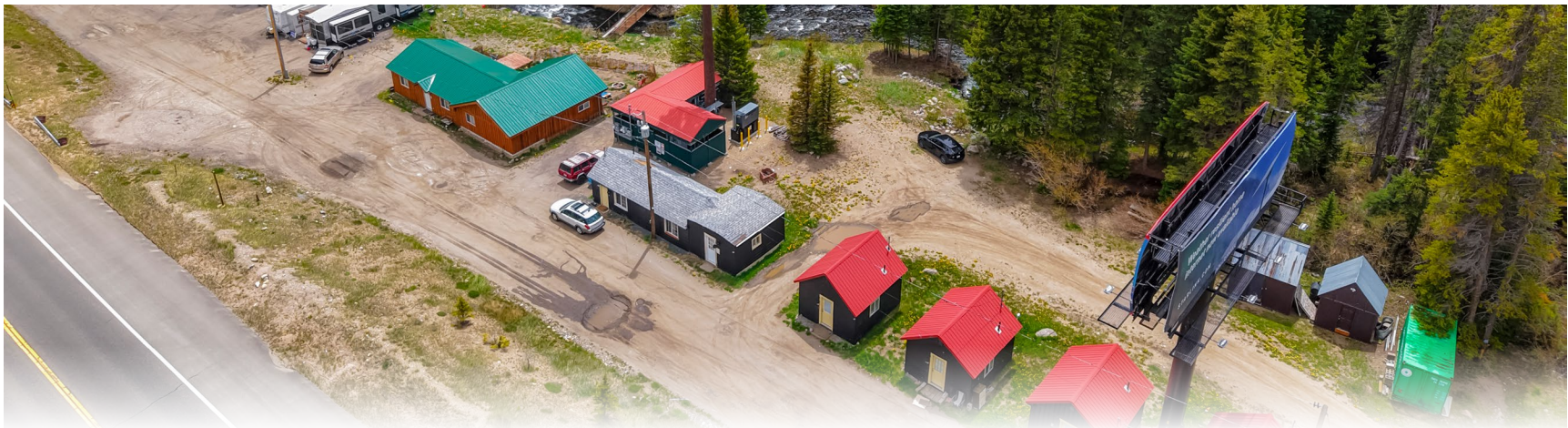
CLEAR CREEK CABINS