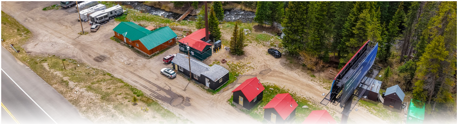
CLEAR CREEK CABINS