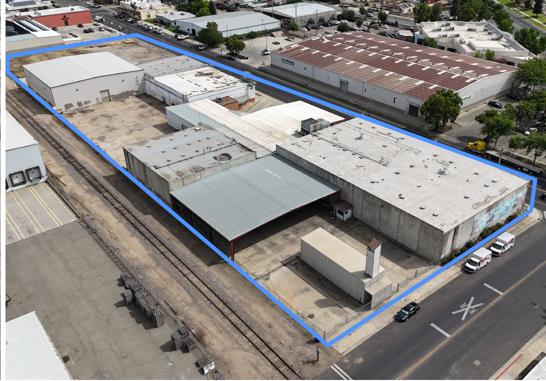
200 N. Uruapan Way Dinuba, California