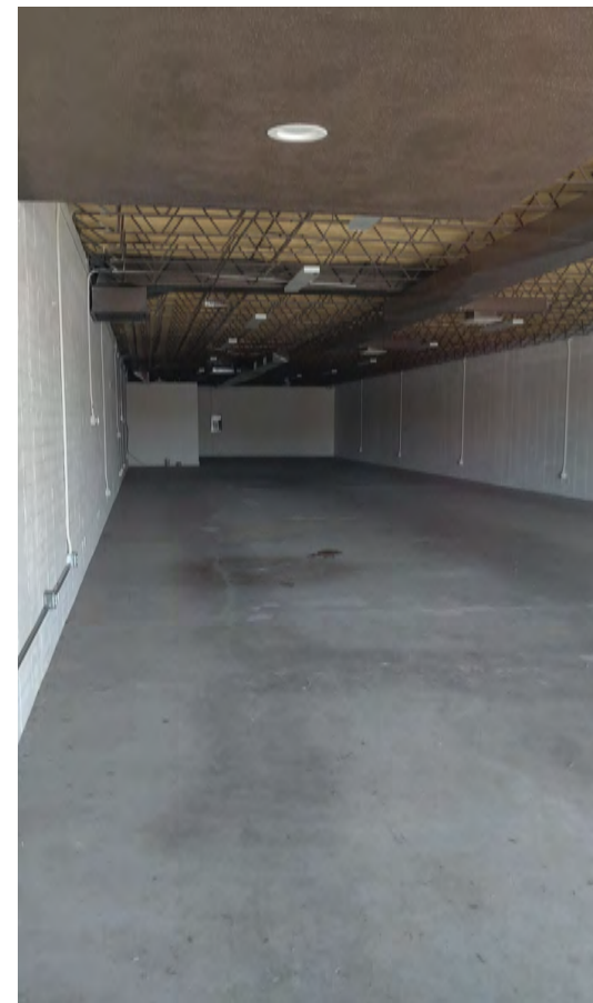
Building 14 Interior +/- 3,000sqft