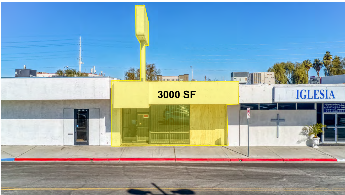
Building 14 Exterior Parking Lot Side

953 E. Sahara Ave. B14, Las Vegas, Nevada 89104