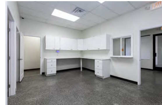
Building 12-13 Interior +/- 6,000sqft