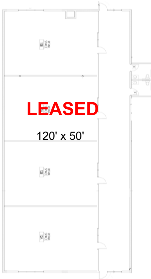
Bldg12-13 Floor Plan 6,000sf :

953 E. Sahara Ave. B14, Las Vegas, Nevada 89104