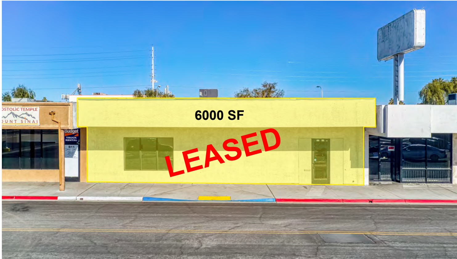
Building 12-13 Exterior Parking Lot Side

953 E. Sahara Ave. B14 Las Vegas, Nevada 89104