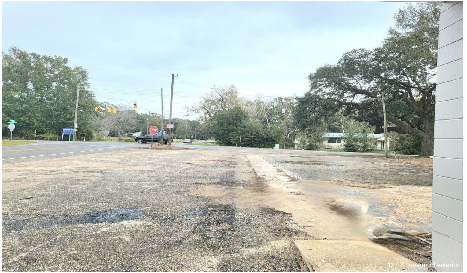
12701 saeger rd exterior