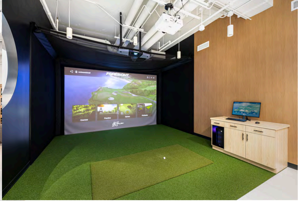
NEW TENANT LOUNGE – GOLF SIMULATOR – CONFERENCE CENTER – ON SITE MANAGEMENT