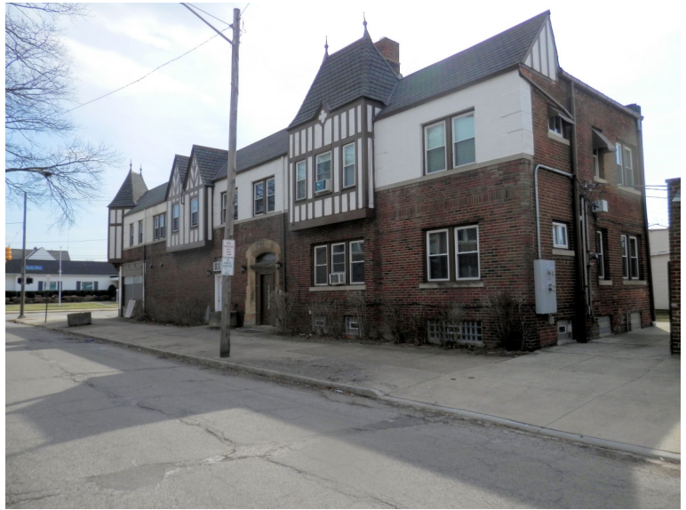
Valleyview Avenue Flight Rentals