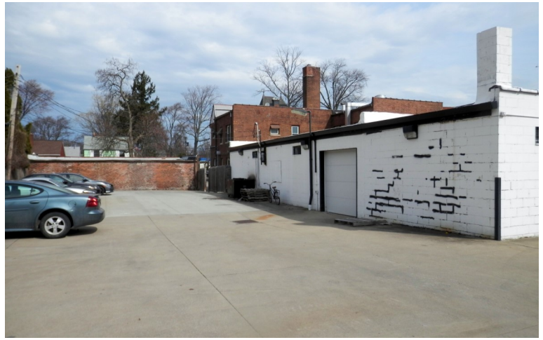
Rear Parking Area