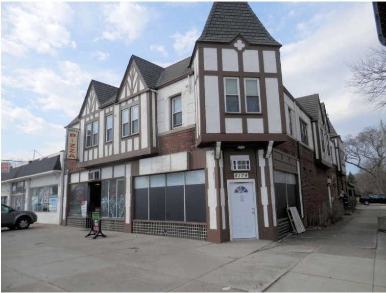
Corner of Rocky River Dr and Valleyview Ave 3 Car Garage