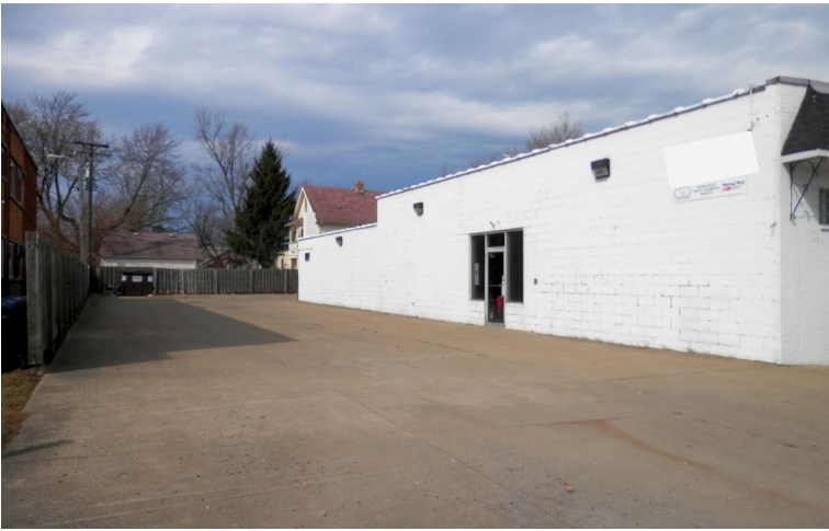
South Parking Lot