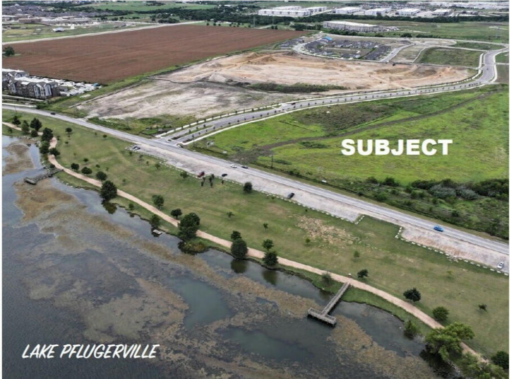
View from Lake 2