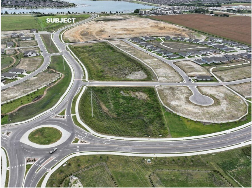
View Lakeside Meadows Project