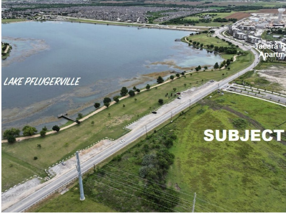
View Property towards Lake