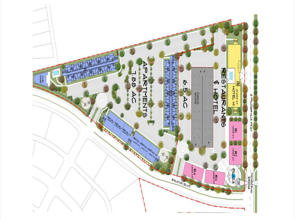
Sample Site Plan 2