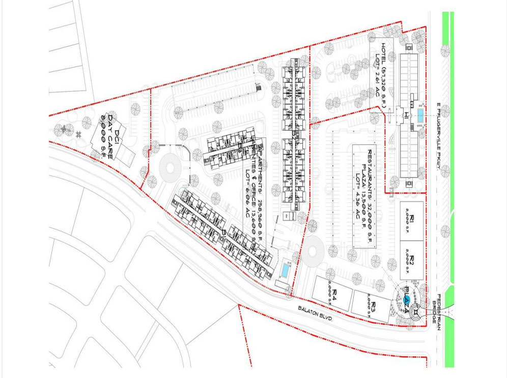
Sample Site Plan 1