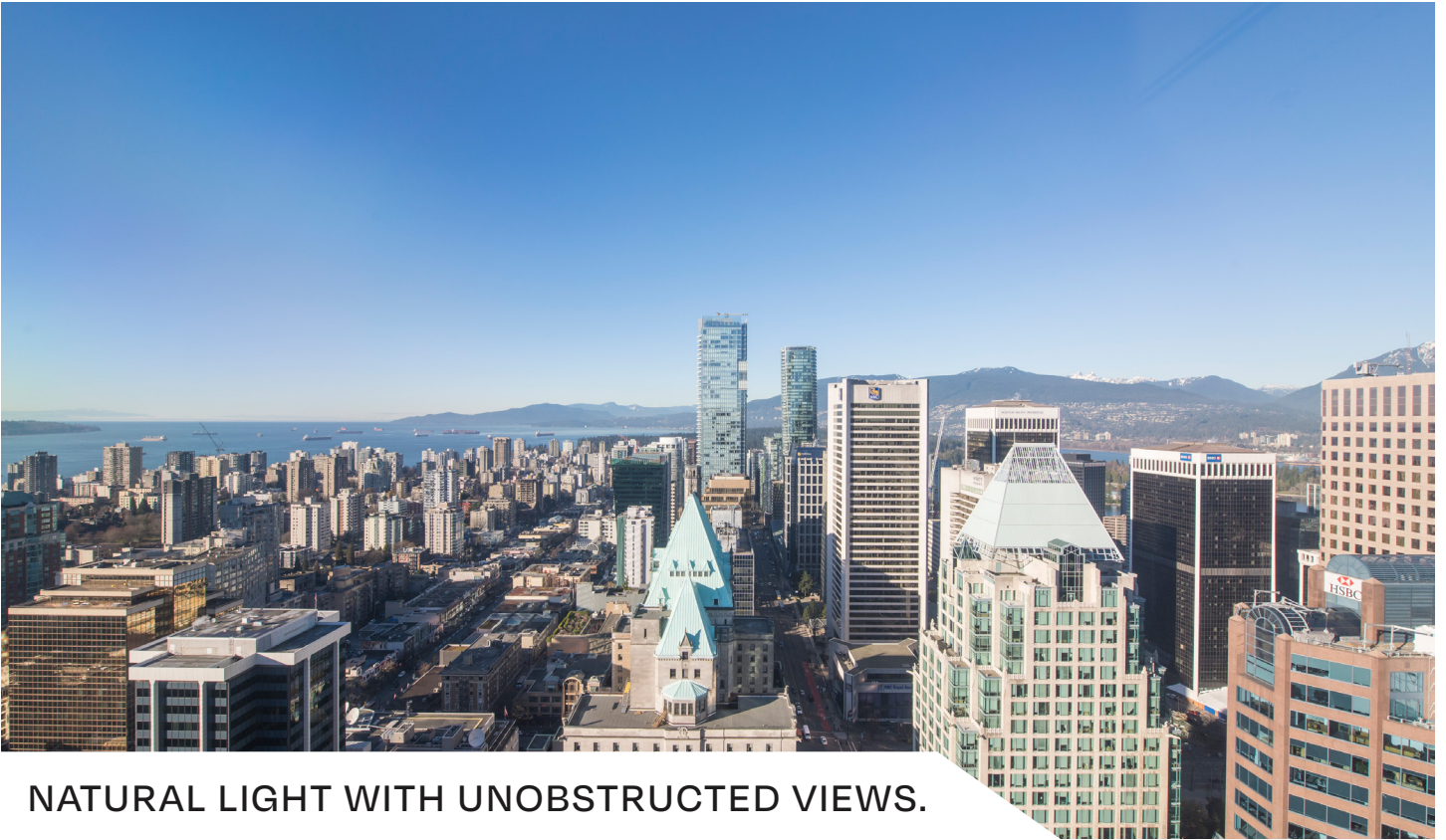
NATURAL LIGHT WITH UNOBSTRUCTED VIEWS.