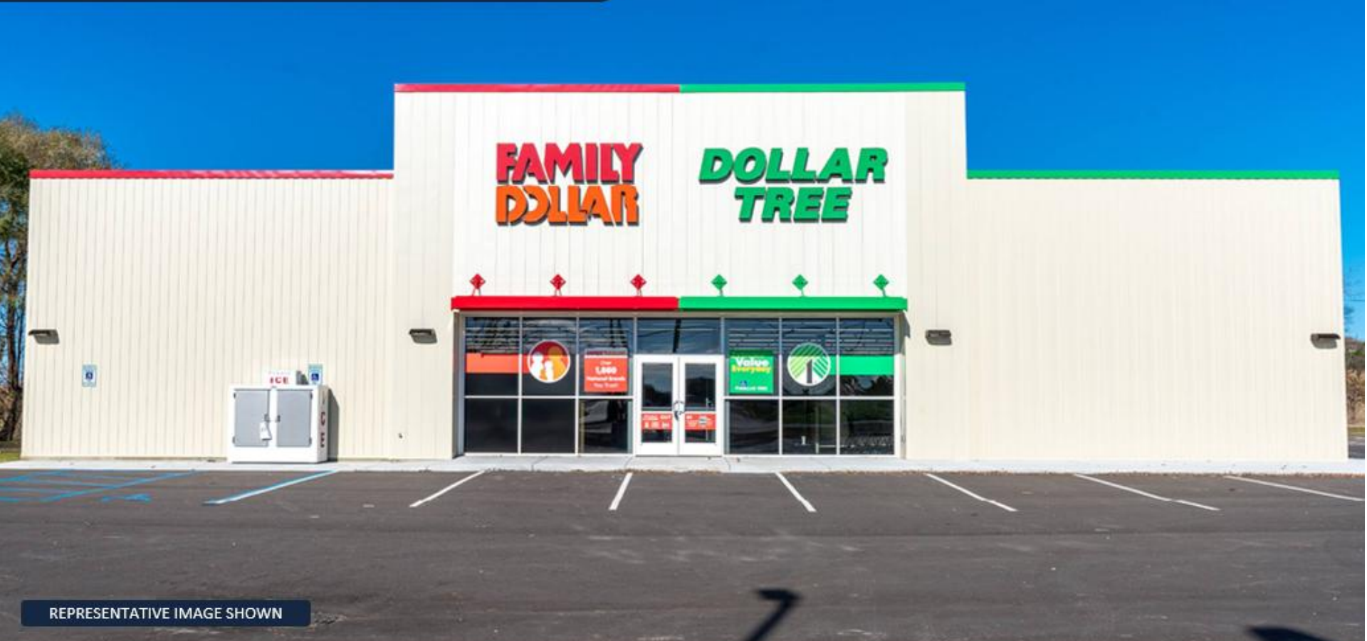
REPRESENTATIVE IMAGE SHOWN